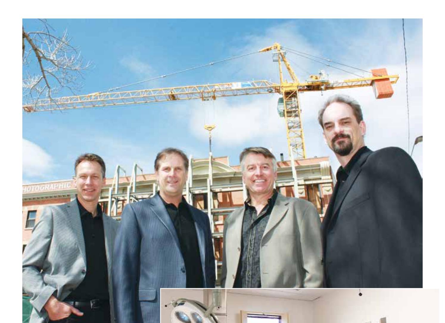
The Executive Team of Delnor Construction Group.